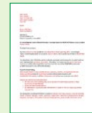
Sample Letters of Appeal and Necessity